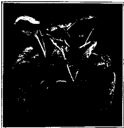
Figure 1.—beet S.L. 68 infected with curly top virus strain 1. The plant with curled leaves, in foreground, would be graded 2 in severity of symptoms and the others 1 or 1.5. Photographed 30 days after inoculation.

(/) 2 and it was found that the variety Old Type was equally susceptible to strains 1 and 3 but that the variety S. L. 68, while fairly resistant to strain 1, was practically immune to strain 3. The comparative symptoms induced on S.L. 842, which is equivalent to Old Type in susceptibility, and on S.L. 68 are shown by figures 1 and 2. These two beet varieties showed a similar difference in response to some other virus strains but the difference for strains 1 and 3 was far more striking than any others.