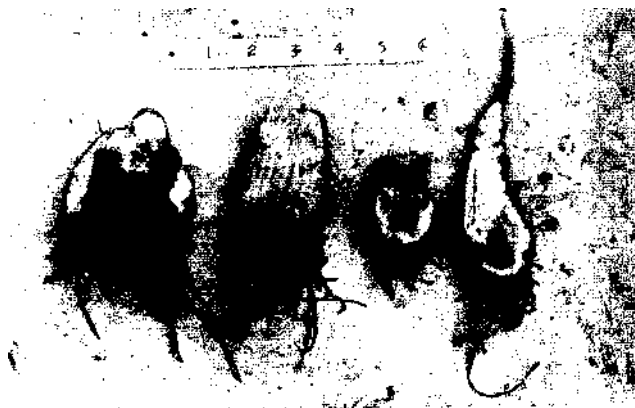
Figure 3. Appearance of some frosted beet roots after having grown normal seed stalks.

If the thermal induction substance is of a chemical nature and is concentrated in the crown tissue, as has been postulated, freezing and subsequent sloughing away of a portion of the crown tissue might conceivably remove some of it. Such a circumstance would also tend to hold the plants in a semi-vegetative condition.