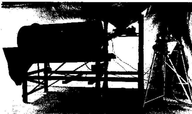
Figure 1. Experimental Seed Treater. Seed hopper is above right end of rotary drum, with seed meter attached to bottom of hopper.

The spray system is the most involved part of a spray-type seed treater and is the part most likely to give trouble in field use, primarily because most of the presently-used treating materials are insoluble powders which must be kept in suspension (usually in water) during application. In order to keep these insoluble materials in suspension, agitation is required in the supply tank, and adequate velocities must be maintained in pipes. The suspended material tends to clog screens and nozzles and may permanently plug small pipes after a shutdown unless the system is flushed. Nozzles must be small because only a very low percentage of moisture can be applied to seeds (less than one per cent maximum on some seeds); yet they and the screens must be large enough to pass the suspended particles of treating material.