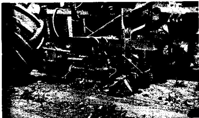
Figure 2.—This view shows the "electric eye" which picks up the light reflection from a plant and relays an electrical impulse to a control box which governs the actual hoeing through a system of sprockets, clutches, electrical controls and spring-mounted cutters. The hoeing will take place on both sides of the plant to be left.