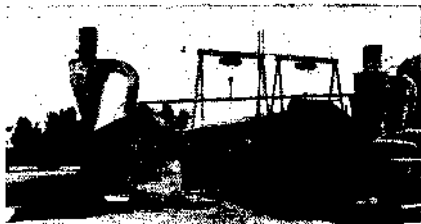
Figure 7. The type of dehydrator in which the chopped leaves and tops have been successfully dried.