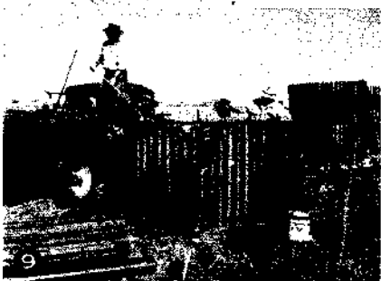
Figure 9. Ensiling leaves may aid in removing moisture. By stock piling leaves, the normal dehydrating season could be prolonged.