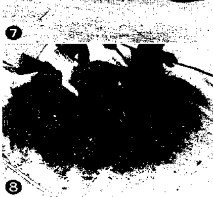
Figure 8. Dehydrated sugar beet leaves.